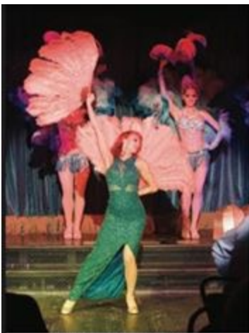
A view of the Butterfly Pavilion at the Phipps Plaza in Miami.